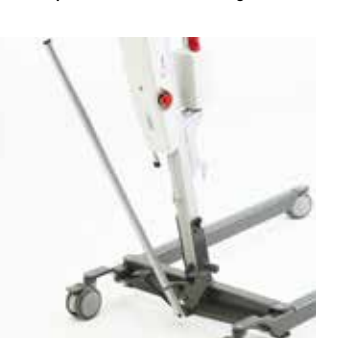
Simply step on the pedal to adjust the leg spread.