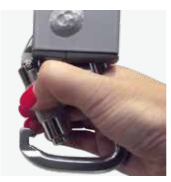
Clip on spreader bar

Easy to change the spreader bar – just twist the safety catch, press to open - and then detach/ attach the spreader bar.