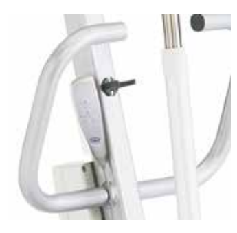
Push bar and hand control

Easy to attach and detach. Available widths: 45cm and 55cm.