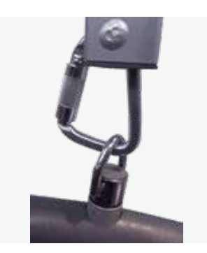
Mounted spreader bar

Easy to change the spreader bar – just twist the safety catch, press to open - and then detach/ attach the spreader bar.