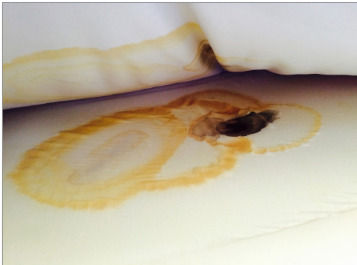
Figure 2. An example of a mattress with strikethrough.

the size and scope of the problem that it came to the attention of senior procurement and clinical managers (Stewart, 2010). In response, UK industry produced and promoted a guide for the care, cleaning and inspection of healthcare mattresses (BHTA, 2011). The aims of this report were supported by equipment manufacturers.