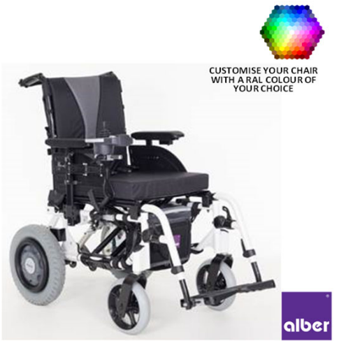
* Configurations may vary from the image shown