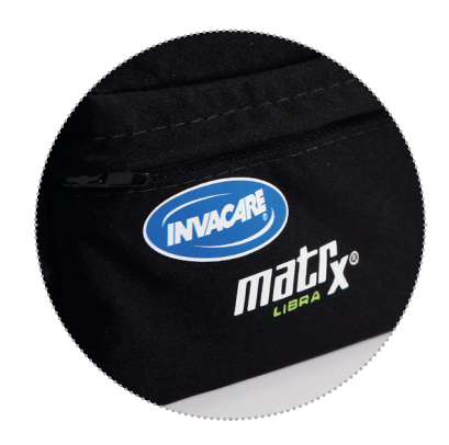
Fig. 2. Cushion Name Label

N.B. The use of a combination of cover and foam that are not from the same manufacturer, may affect the cushions pressure care properties.