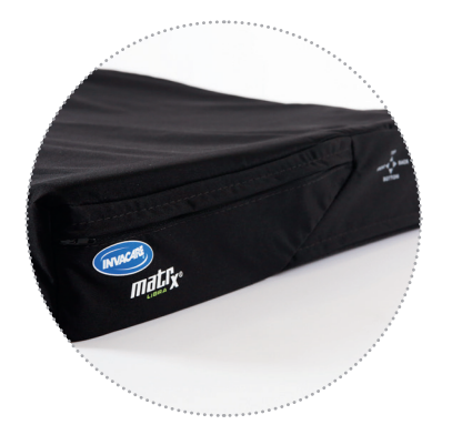
Fig. 1. Ingress Resistant Material

These features will significantly reduce the risk of fluid ingress and provide protection for the foam core.