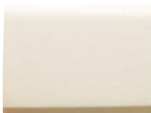
Lumbo Sacral Support