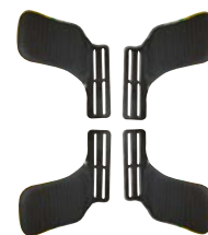
Offset Fixed Lateral Pads