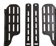
Chest Harness Interface

Cover - Oversized cover featuring SuperSoft HR foam layered over firm HR foam for comfort and protection. Attractive Meshtex cover is water resistant and breathable.