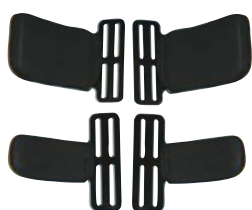
Fixed Lateral Pads