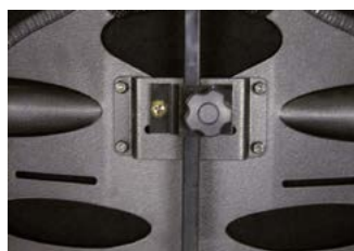
Headrest Adapter Plate