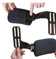
Offset Swing Away