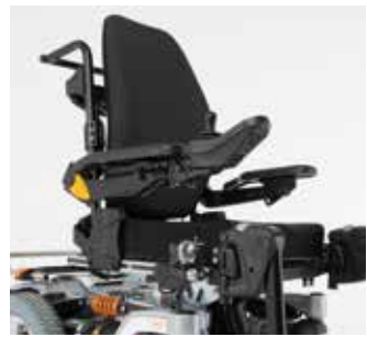
Modulite™ seat system

The elegant and stable telescopic column lift has a range of 250 mm.