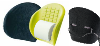
Back support with lumbar and handle