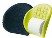
Back support with lumbar