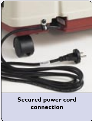
Secured power cord connection

The Platinum® 9 has been designed to have the minimal number of parts so that low level of critical spares need to be retained - very cost effective! With no delivery, low maintenance costs together with a five year warranty, the Platinum® 9 gives you the best value added concentrator.