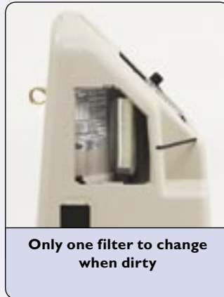
Only one filter to change when dirty