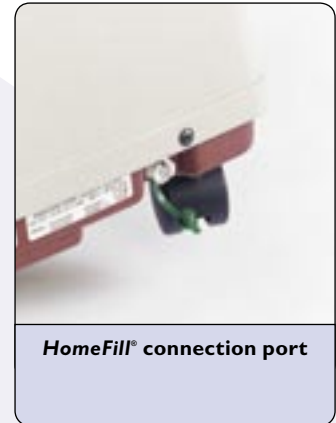
HomeFill® connection port