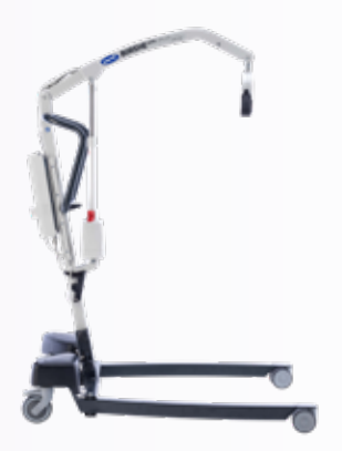
Birdie EVO XPLUS

A smaller size allows the Birdie<sup>EVO COMPACT</sup> to easily operate in environments where space is limited.