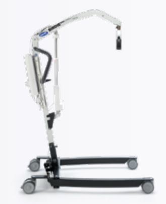
Birdie EVO COMPACT

A redesigned version of the market leading Birdie mobile hoist, designed to support safe transfers in both domestic and residential care.