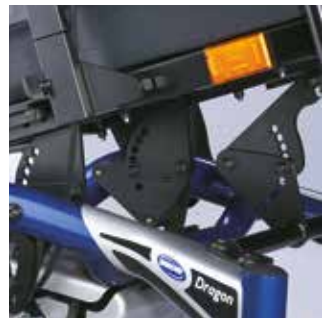
Tilt and Seat Height

Invacare Dragon features a range of seating, a manual settable seat tilt and 6 km/h motors. It is adjustable to suit the needs of clients and all parts of the power chair are accessible for ease of servicing.