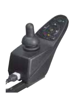
Shark II Control

With this new feature seat height and tilt can be easily adapted to the clients needs.