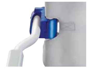
Wider XL armrests

For additional stability positions. Will benefit small individuals and young adults.