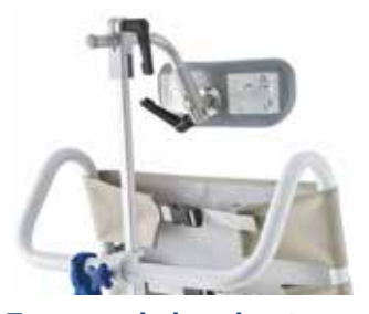
Ergonomic headrest holder

Can be used to support abnormal posture or smaller/young adults. Can be used across all models.