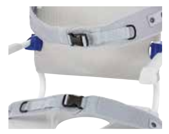
Chest-belt & Pelvic Belt

For additional safety. Client can grip bar for additional re-assurance.