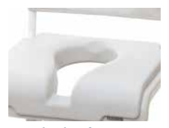
Standard Soft Seat

With key shaped cut out for hygiene access. Supplied as standard.