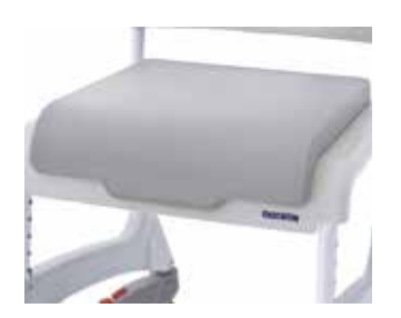
Universal soft seat

Simply snap-on. (Fits soft seat and key-shaped cut out).