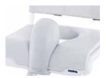
Splash guard / pommel

With small opening suitable for smaller and young adults.