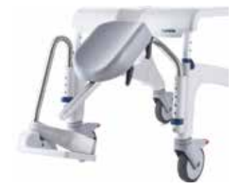
Calf & amputee support

Increases width between armrests by 40mm each side. Does not increase the weight limit.