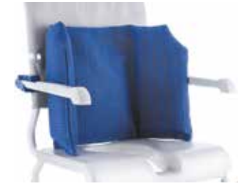
Soft backrest cushion

This support reduces the backrest width and can help position the trunk.