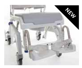
Shortened leg rests

Increased support helps distribute load to avoid pressure on lower limbs.