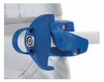
Armrest locking device

To ensure necessary safety during the positioning process. Chest belt standard. Pelvic belt optional.