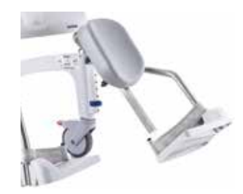
Calf support with footrest

Padded. Both height and angle adjustable.