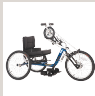
The Top End Li'l Exceleator handcycle is designed for children and has 20" cruiser wheels and tyres.