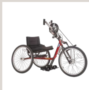
Invacare Top End Exceleator handcycle.