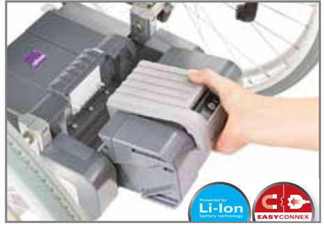
Insert the battery pack effortlessly. It's simple and safe.