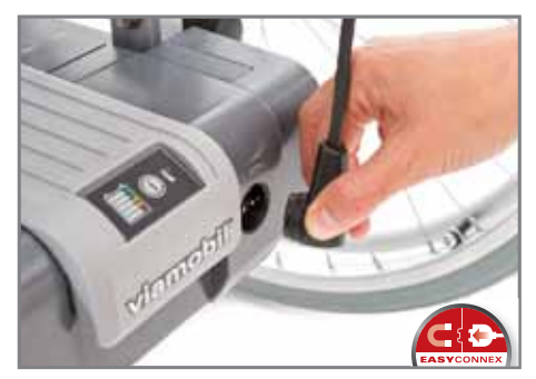
Plug the control unit into the battery pack and off you go!