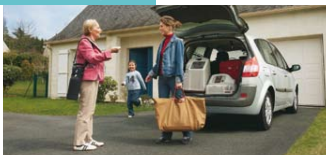
Travelling is easy with the modular design.