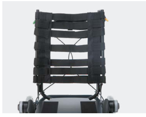
Flex 3 tension adjustable backrest

Provides firm and stable support in combination with the backrest cushions. The plate is height and width adjustable. (A) (D)