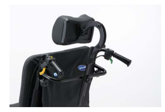
Push handles connected with headrest attachment

Height adjustable push handles with receiver for various head and neckrests. Fits in combination with Invacare® Matrx® headrests. (A) (D)