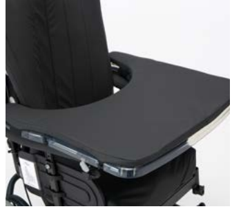
Table tray cushion

Soft 30 mm cushion attached with elastic straps. (A) (C) (D)