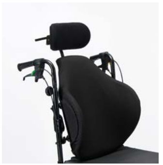
Invacare® Matrx® Elite Deep

Positioning backrest with an aluminum shell and 80 mm contour depth, hip with scapular cutouts. Adjustable depth, height, angle, and rotation. (A) (D)