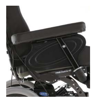
Dahlia 30 & 45

Adjustable in height and the side guard is adjustable in depth.