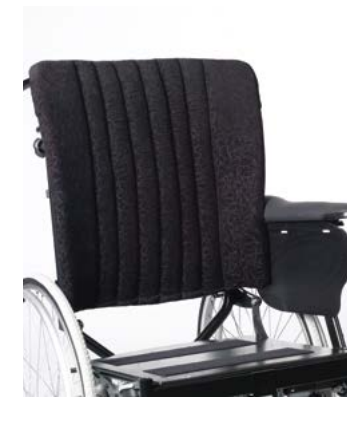
Cover for tension backrest

The backrest can be tailored to fit more complex spine shapes. Both width and height adjustable it can be fitted with the padded backrest cover or choice of cushion. (A) (D)