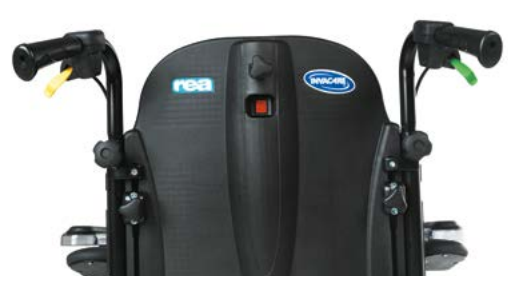
Push handles divided

Height adjustable push handles with receiver for various head and neckrests. Fits in combination with Invacare® Matrx® headrests. (A) (D)