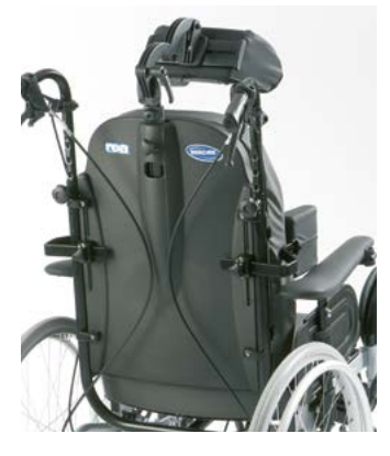
Laguna backrest plate

Stable and height adjustable backrest. (C)