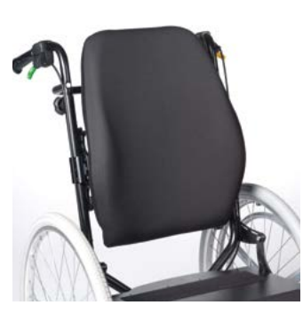
Invacare® Matrx® Elite TR

Positioning backrest with thick upholstery based on an aluminum shell and contoured depth, hip and scapular cutouts. Adjustable in height, angle and rotation.