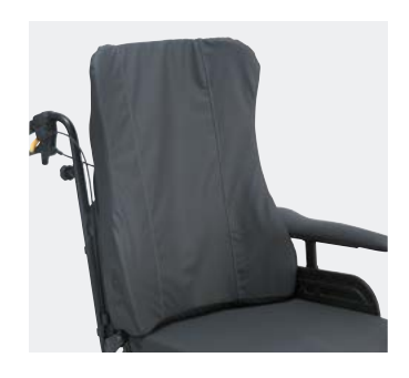
Cushion Shoulder High 05

The Shoulder High backrest cushion is the same as Passad 2 but 100 mm higher, designed for taller people. (A) (D)