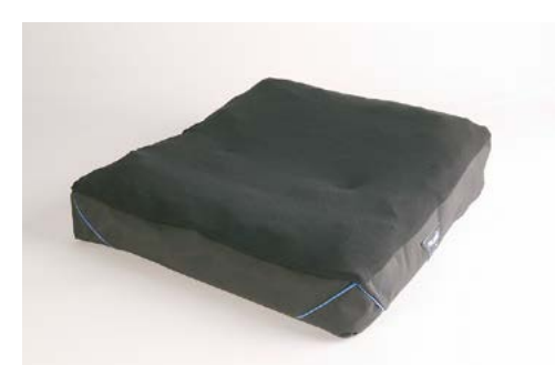
Cushion Vicair Multifunctional

Seat cushion conforms to the shape of (A) (D) the person for a personalised fit.