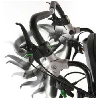
Angle adjustable push bar

Can be lifted up or down to suit the assistants' needs. Easy to adjust with two buttons.