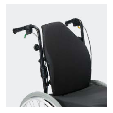
Invacare® Matrx® Elite

Positioning backrest with an aluminum shell and 80 mm contour depth, hip with scapular cutouts. Adjustable depth, height, angle, and rotation. (A) (D)