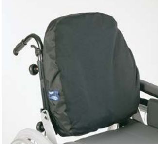
Cushion Vicair Multifunctional

The Shoulder High backrest cushion is the same as Passad 2 but 100 mm higher, designed for taller people. (A) (D)