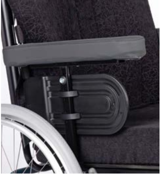
Azalea and Clematis

Adjustable in height and the side guard is adjustable in depth.