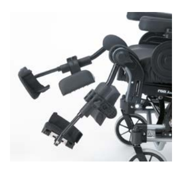
Angle adjustable legrest with adjustable footrests

The high pivot point gives leg-length compensation when angling the legrest.