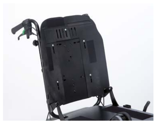
Flex 3 backrest plate

Stable and height adjustable backrest. (C)