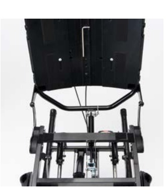
Wider backrest pivot joint

+50mm width extension of the backrest pivot brackets allows a larger backrest to be mounted to a smaller chassis. Only possible on the 390 & 440mm Small & Medium chassis sizes. (D)