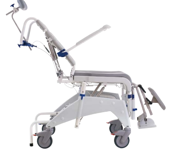
Seat tilt 0°, backrest recline 25°.