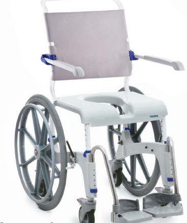
Aquatec Ocean Self Propel*