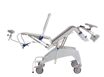
Full seat tilt 35°, backrest recline 50°.