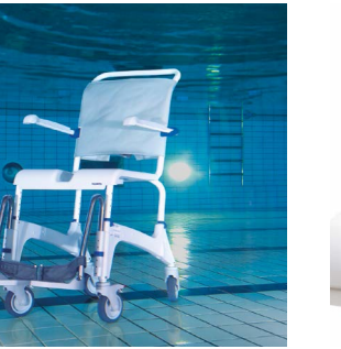
Stable, stainless steel frame. Corrosion resistant. Can be used in hydro pools.