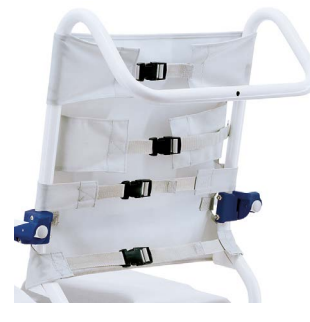
Tension adjustable back can be adjusted to the client.

Adjustable in 3 steps, no tools required. 510-610mm.