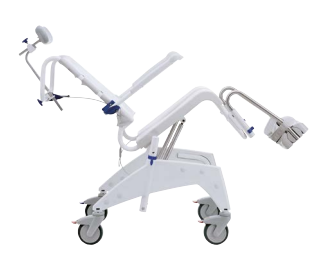
Seat tilt _____ Tilt angle 0° - 35°.