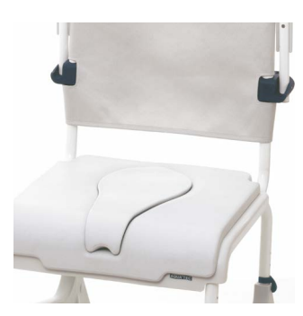
Standard soft seat with key shaped cut out for hygiene access and insert (supplied as standard on all models).

Adjustable in 3 steps, no tools required. 510-610mm.