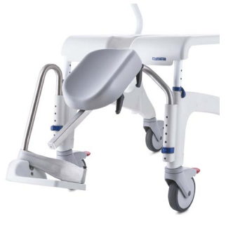
Calf and amputee support

Incl. brakes and quick release axles. For Ocean. Used to upgrade a transit to self propel