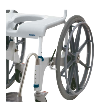
24" wheels (set)

Incl. brakes and quick release axles. For Ocean. Used to upgrade a transit to self propel