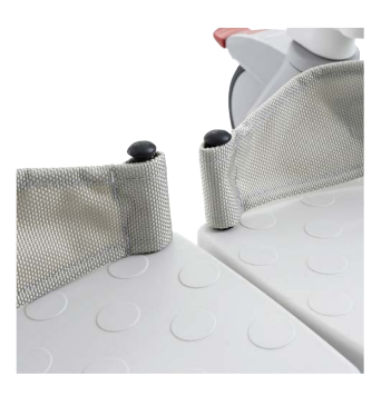
Height and angle adjustable swing away footrests with textured footplates and heel loops. Standard on all models.

Individually adjustable seat height. 410-540mm.