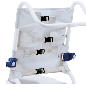
Tension adjustable back can be adjusted to support posture.