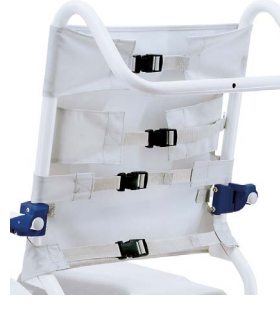
Tension adjustable back can be adjusted to support posture and increase seat depth.

More space between the armrests with a load capacity of up to 180 kg.