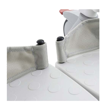
Height and angle adjustable swing away footrests with textured footplates and heel loops.