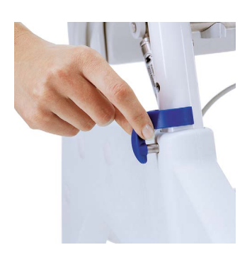
Adjustable seat height

Height and depthadjustable headrest included.