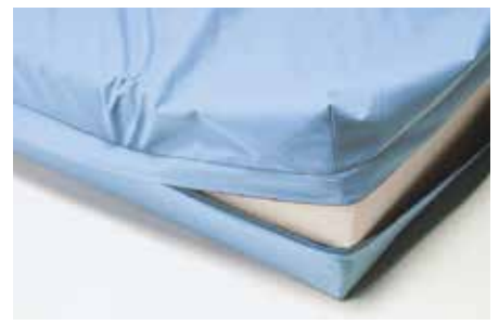
Invacare Dacapo Mattresses**

Folding panels have a safe locking mechanism which can only be opened by releasing two latches.